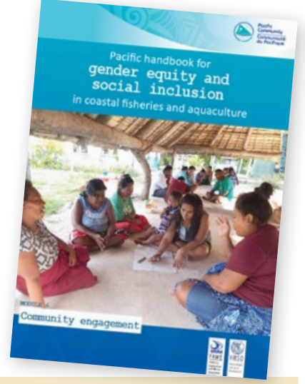
Module 6, Community engagement. ©SPC

Funded by the European Union and Government of Sweden, the PEUMP programme promotes sustainable management and sound ocean governance through a holistic and multi-sectoral approach, thus contributing to social, economic and environmental development in the Pacific, as well as biodiversity protection and promoting the sustainable use of fisheries and other marine resources. The PEUMP programme focuses on equitable benefits for all Pacific Island countries, while recognising the diversity of resources, needs and opportunities among its 15 Pacific countries of work – the Cook Islands, Fiji, Federated States of Micronesia, Kiribati, Nauru, Niue, Palau, Papua New Guinea, Republic of the Marshall Islands, Tuvalu, Tonga, Samoa, Solomon Islands, Timor Leste and Vanuatu.