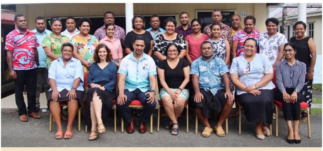
Attendees of the training.