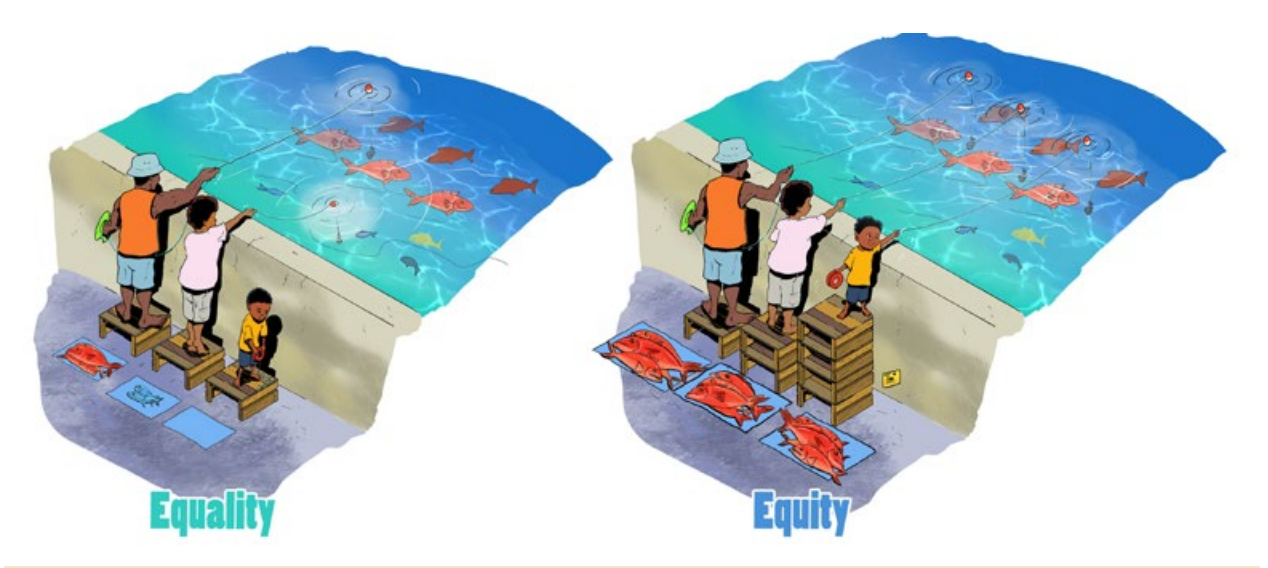
Figure 2. Illustrations explaining the difference between equality (left) and equity (right).

The session encouraged participants to go beyond project design for the "majority", and to consider those that are typically left out. This means that fisheries extension staff should consider themselves as equal opportunity providers, taking active steps to facilitate the participation and inclusion of various groups for equitable outcomes.