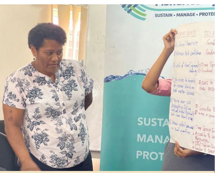
Participants at the training.